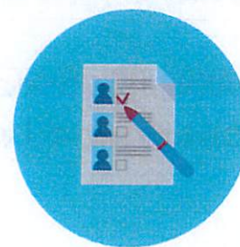
At Your Polling Place on Election Day